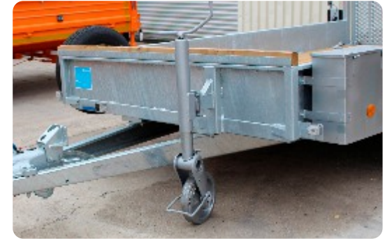
Big support wheel with 700kg support load - mounted at the strengthened frontwall