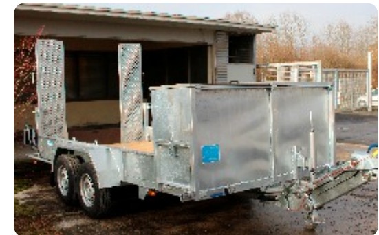
Double storage box - to be loaded from above and through flaps from the sides

as well without photos: different loading measures, net hooks, further lashing points, spare wheel and holder, winch, ramps with wooden surface etc.