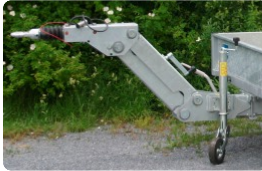
Height adjustable drawbar (model 441/3500)