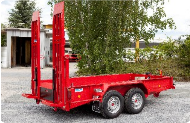
Minitrailer for the transport of lifting platform