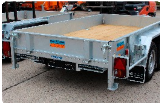
Ramps inserted underneath the loading area, with rear lid