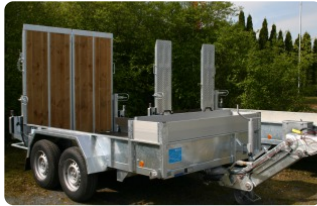
Minitrailer with section in front, closed loading ramp with wooden surface