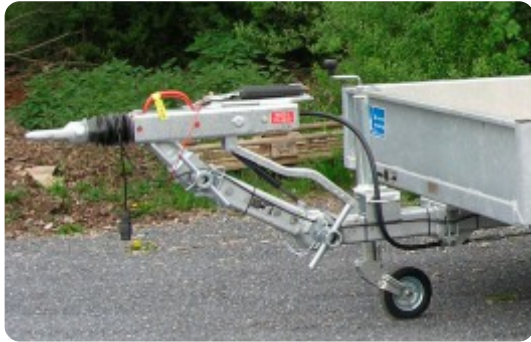
Height adjustable drawbar (up to 3150kg TW)