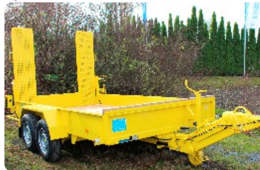
Varnishing in the colour at buyer's option instead of galvanizing