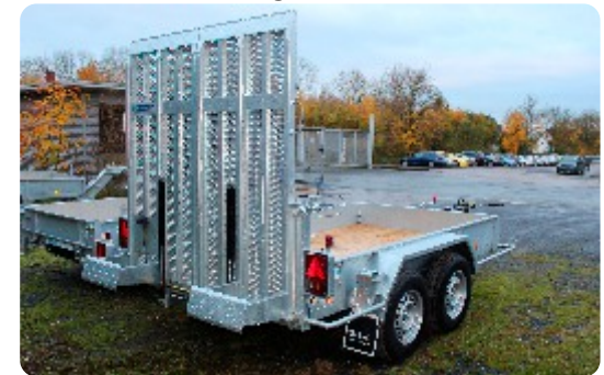
Closed loading ramp, 1x lengthway divided