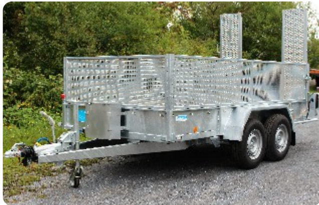
Minitrailer with attachment for leaves and box at the front wall