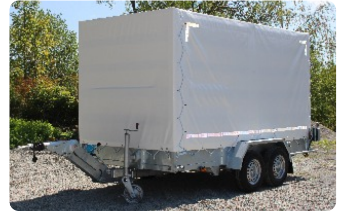
Tarpaulin top, strong support wheel and height adjustable drawbar