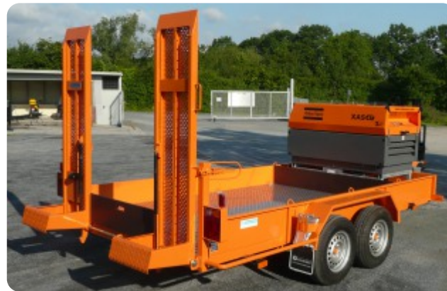
Minitrailer with mounted compressor and aluminium-chequer plate floor