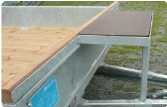
Shelf for excavator shovel - Hardwood wedge and/or tray table mounted at the front wall