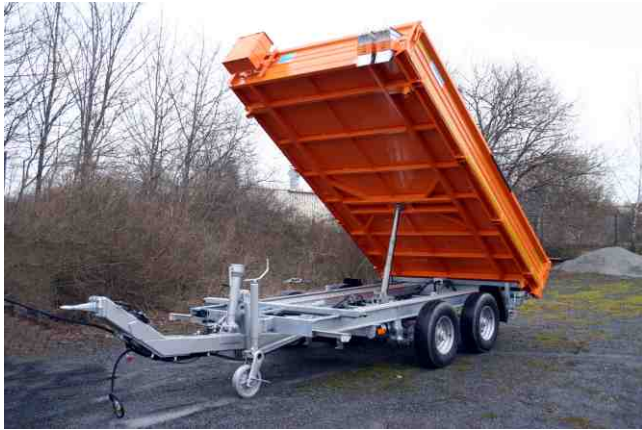
Total weight 5000 kg , order number 845/5000, net load approx. 3100 kg, loading gauge approx. 4000x2300 mm, loading height unloaded approx. 850 mm, accessories: zink coated chassis, tool box