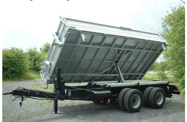
Total weight 18000 kg , order number 889/18000, net load approx. 13800 kg, loading gauge approx. 5000x2420 mm, loading height unloaded approx. 1110 mm, twin tired (eight tires) accessories: feather jack and central locking