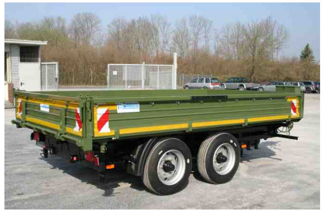
Total weight 6900 kg , order number 852/6900, net load approx. 4650 kg, loading gauge approx. 4000x2300 mm, loading height unloaded approx. 880 mm, accessories: tool box, warning stripe, hooks