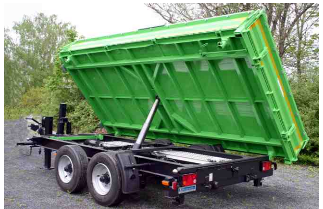
Total weight 10500 kg , order number 885/10500, net load approx. 7800 kg, loading gauge approx. 4500x2300 mm, alternatively 4500x2420 mm, loading height unloaded approx. 930 mm