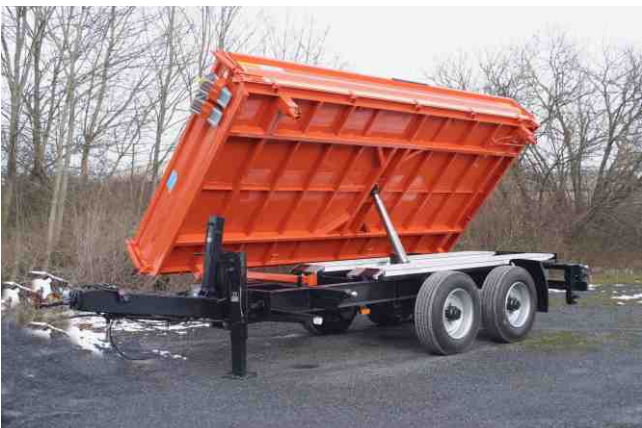
Total weight 14000 kg , order number 888/14000, net load approx. 10850 kg, loading gauge approx. 4500x2420 mm, loading height unloaded approx. 1100 mm, single tired (four tires)