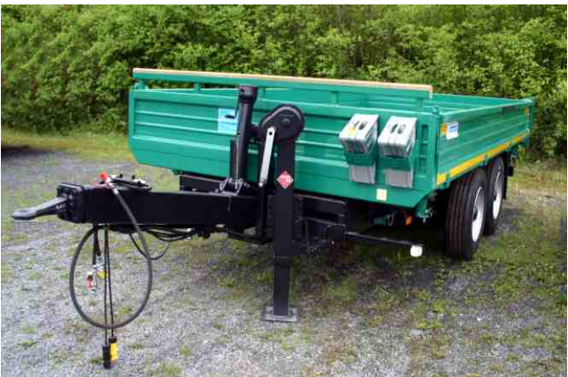
Total weight 8900 kg , order number 863/8900, net load approx. 6450 kg, loading gauge approx. 4500x2300 mm, loading height unloaded approx. 880 mm, accessories: shelf for bucket